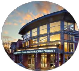
Concord Law School

Durham is an idyllic New England college location with a small-town friendliness and welcoming nature that pairs perfectly with the proximity to big-city opportunities. New Hampshire and Maine's rocky beaches are just moments away. Head north and in an hour you're in New England ski country; take the bus, train or a car one hour south, and you're in the heart of bustling Boston.