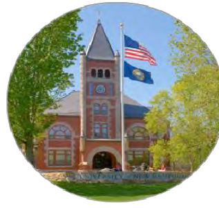
Durham (Main Campus)