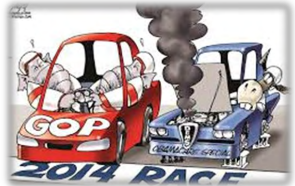
2014 Mid-Term Elections